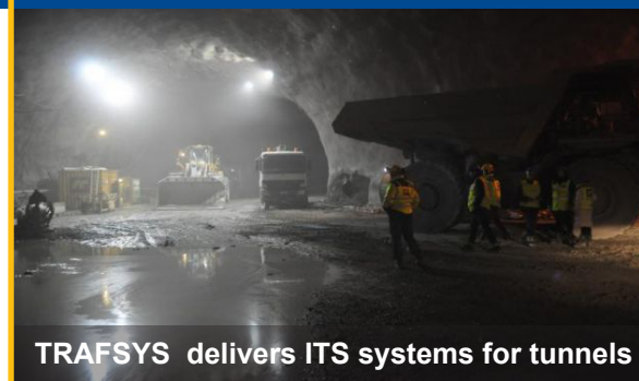
TRAFSYS delivers ITS systems for tunnels

The T-Connection (T-Forbindelsen) is the largest road construction project ever to be completed on the south-west coast of Norway. TRAFSYS has delivered a number of intelligent traffic solutions (ITS) for this project, including a radio system, Norphonic emergency roadside telephones, video surveillance, LED signals and a traffic management system.